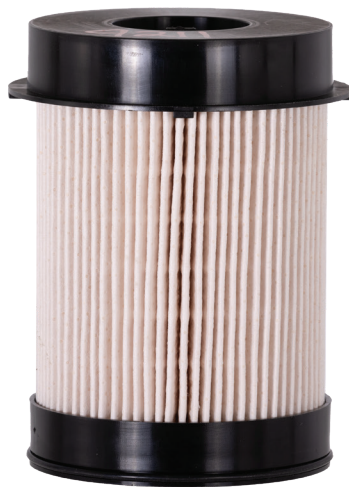
NAPA OE Replacement Previous Design