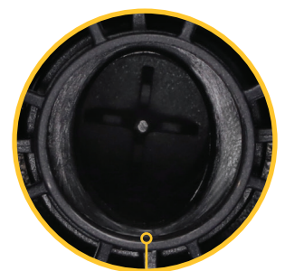
Oval gasket more closely matches OE