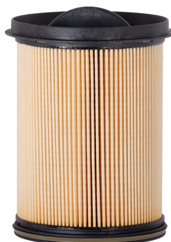
NAPA OE Replacement Improved Design